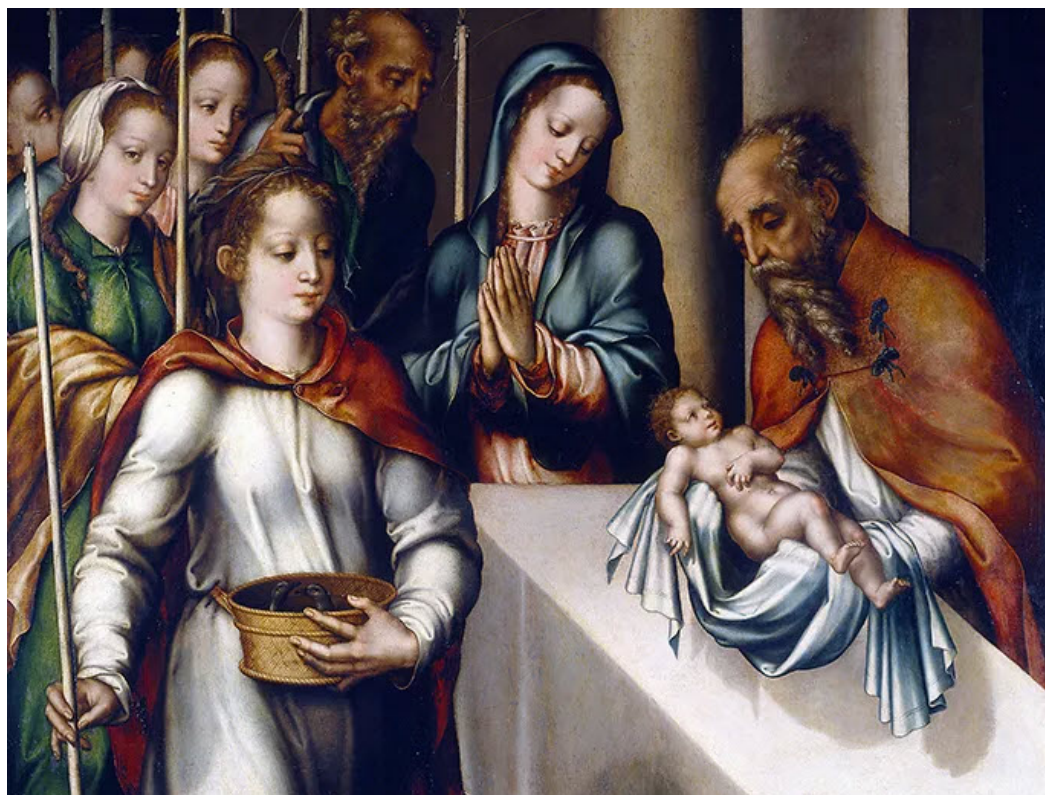
Luis de Morales, "The Presentation in the Temple," 1562

We stand near the place of new birth. We turn from the crib to the cross. We go to carry his light. Lest us shine with the light of your love. Thanks be to God.