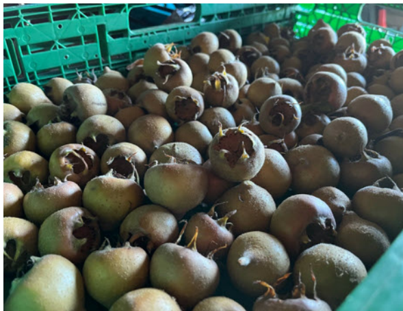
Medlars left to 'blet' (turn soft).