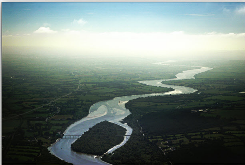
The river Suir