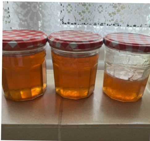
Delicious medlar jelly.